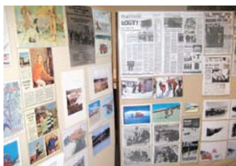
Images of an earlier period in the history of the Perisher Range Resorts.