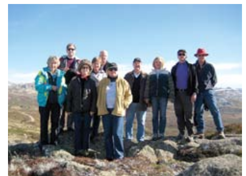
Members of the Perisher Historical Society on the side of Mt. Stillwell.