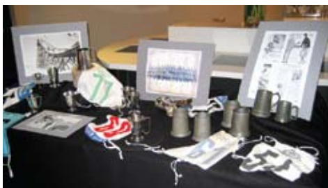
Some of Bill Day's donated Olympic memorabilia on display at Snow Gums Restaurant.